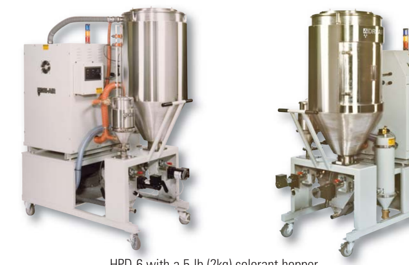
HPD-6 with a 5-lb (2kg) colorant hopper

Our Dri-Shot receiver is the only press mounted component