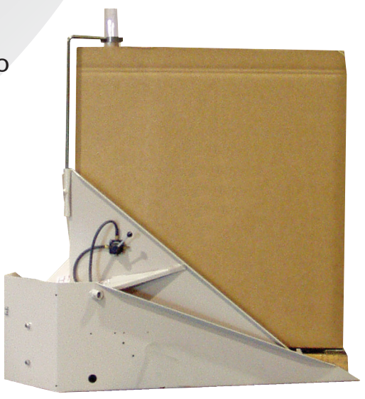
TT-2500 floor level

Economical tilt table accepts all common Gaylord sizes, up to 2500 pounds (1135 Kg) and is fitted with convenient hand-operated control.